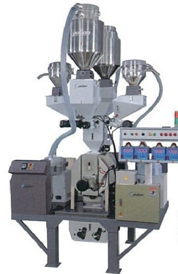
SB Specialized Type Four Material Mixing Proportionally